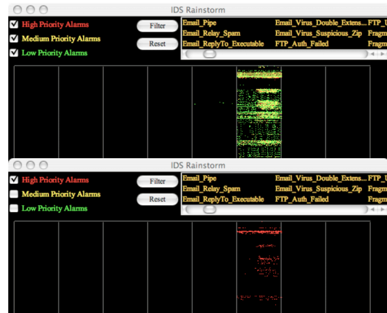
Figure 1: Filtering on high priority alarms.

Copyright is held by the author/owner(s). VizSEC'06, November 3, 2006, Alexandria, Virginia, USA. ACM 1-59593-549-5/06/0011.