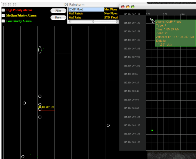
Figure 2: ICMP Flood alarm filtered. Alarms circled occurred simultaneously for those hosts.